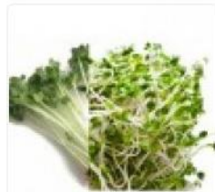
Alfalfa Radish Sprouts