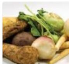
Asian Vegetable Root