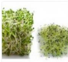
Alfalfa and Onion Sprouts