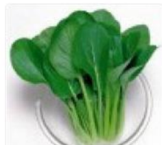
Asian Vegetable Leafy