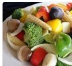
Asian Vegetable Other